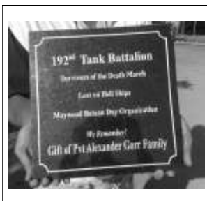
Hell Ship Memorial Plaque