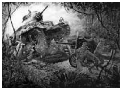
Allied tank breaks through

The Army had expected to give these young Americans additional military training and develop the fighting skills of the newly mobilized Philippine forces, but that training