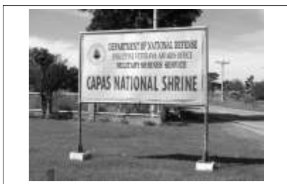
Capas National Shrine

They were loaded in these box cars in San Fernando, Pampanga Province, and exited north in Capas, Tarlac Province. From Capas, they marched