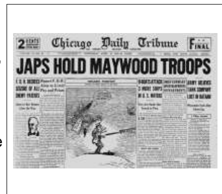
Newspaper headline of surrender

There would be more misery, more starvation, and more indignities, but most of all, there would be much, much more death before freedom. Of the nearly 10,000 Ameri-