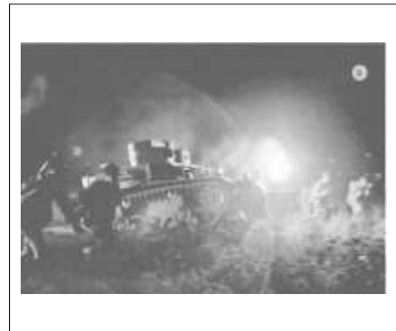
33rd Tank Company in training

They were barely more than kids, only in their teens and early twenties. Their buddies from Proviso High School called them "Weekend Warriors". They were members of the 33rd Tank Company, 33rd Infantry Division of the Illinois National Guard, based at the Armory in Maywood, Illinois. In September 1940, the Draft Act had been passed and selected National Guard Units were called into active duty to prepare for the possibility of entering the war in Europe. The 33rd Tank Company was organized May 3, 1929 at Maywood, Illinois and was inducted into active Federal service as Company "B" of the 192nd Tank Battalion on November 25, 1940.