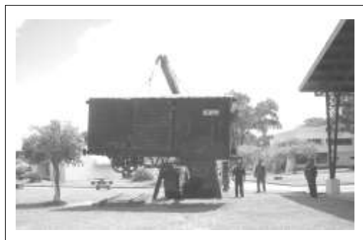
Box Car Relocation

the few miles to Camp O'Donnell, the first POW camp after the Death March. Later, many were relocated to Camp Cabanatuan because of the high death toll at O'Donnell. Cabanatuan was site of the late January, 1945 rescue, "The Great Raid."