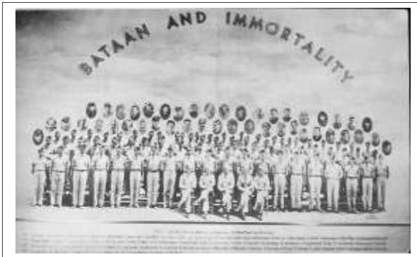
The Lido Theatre Bataan Mural

(Origins of Maywood Bataan Day Continued from page 9)