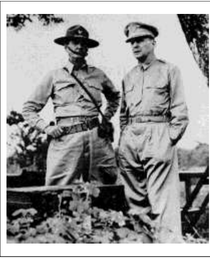
Gen. Wainwright (L) and Gen. MacArthur

(Origins of Maywood Bataan Day Continued from page 7)