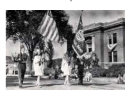
Proviso High School Marching Band

In 1946, the “Veterans Council” was organized from VFW, American Legion and ABC members—as well as returning survivors of the 192 nd —but also other members of the American Legion and Veterans of Foreign Wars. On Bataan Day 1946, the returned heroes of Bataan, who were able, marched down Fifth Avenue in Maywood at the head of the Bataan Day Parade as honored guests of their hometown. On that same day the ABC helped dedicate a memorial in Maywood that featured a light tank, similar to the one that the men of the 192 nd had used in the defense of Bataan.