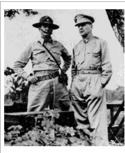
Gen. Wainwright (L) and Gen. MacArthur

(Origins of Maywood Bataan Day Continued from page 5)