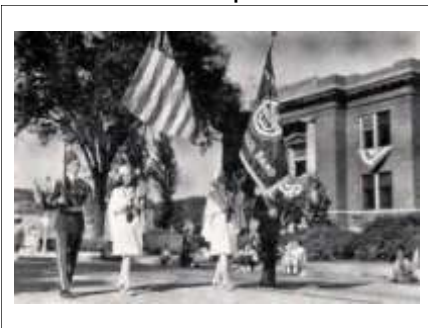
Proviso High School Marching Band

In 1946, the “Veterans Council” was organized from VFW, American Legion and ABC members—as well as returning survivors of the 192 nd —but also other members of the American Legion and Veterans of Foreign Wars. On Bataan Day 1946, the returned heroes of Bataan, who were able, marched down Fifth Avenue in Maywood at the head of the Bataan Day Parade as honored guests of their hometown. On that same day the ABC helped dedicate a memorial in Maywood that featured a light tank, similar to the one that the men of the 192 nd had used in the defense of Bataan.