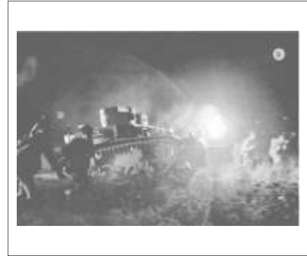
33rd Tank Company in training

They were barely more than kids, only in their teens and early twenties. Their buddies from Proviso High School called them "Weekend Warriors". They were members of the 33rd Tank Company, 33rd Infantry Division of the Illinois National Guard, based at the Armory in Maywood, Illinois. In September 1940, the Draft Act had been passed and selected National Guard Units were called into active duty to prepare for the possibility of entering the war in Europe. The 33rd Tank Company was organized May 3, 1929 at Maywood, Illinois and was inducted into active Federal service as Company "B" of the 192nd Tank Battalion on November 25, 1940.