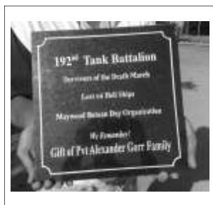
Hell Ship Memorial Plaque