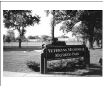
Maywood Veterans Memorial Park