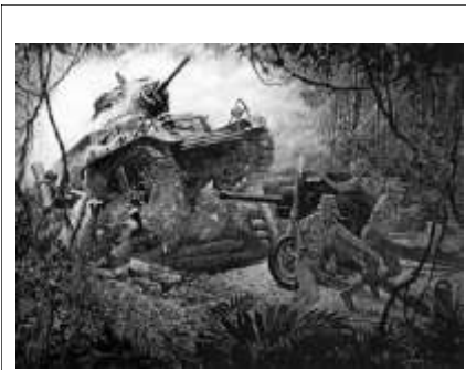
Allied tank breaks through

The Army had expected to give these young Americans additional military training and develop the fighting skills of the newly mobilized Philippine forces, but that training never happened. In less than three weeks, on December 7, 1941, Pearl Harbor was attacked; six battleships went down to the bottom of the harbor. A few hours after the attack on the Hawaiian Base, Japanese bombs smashed into Clark Field and other bases on Luzon. Thereafter, Japan dominated both the air and the waters around Luzon.